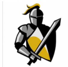
BLACK KNIGHT EMPOWER