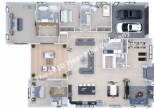
3D Floor Plan - Premium (High-Quality Rendering) - Sample