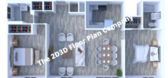
3D Floor Plan - Economy (Standard-level Rendering) - Sample