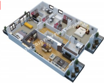
3D Floor Plan - Premium (High-Quality Rendering) - Sample